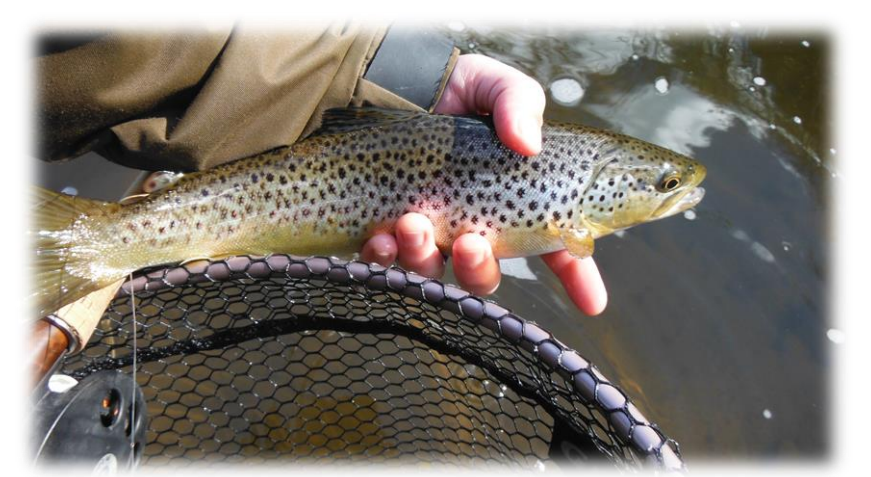
Catches of Brown trout over 10" (25cm) from the River Whiteadder were above average during the 2020 Brown trout fishing season

Only four anglers submitted catch records for the River Whiteadder for the 2020 trout fishing season covering 25 fishing trips and 77 hours of angling effort. Whilst the number of catch returns is down on previous seasons it is likely that this is representative of reduced permit sales resulting from fewer numbers of visiting anglers as a result of COVID-19 restrictions.