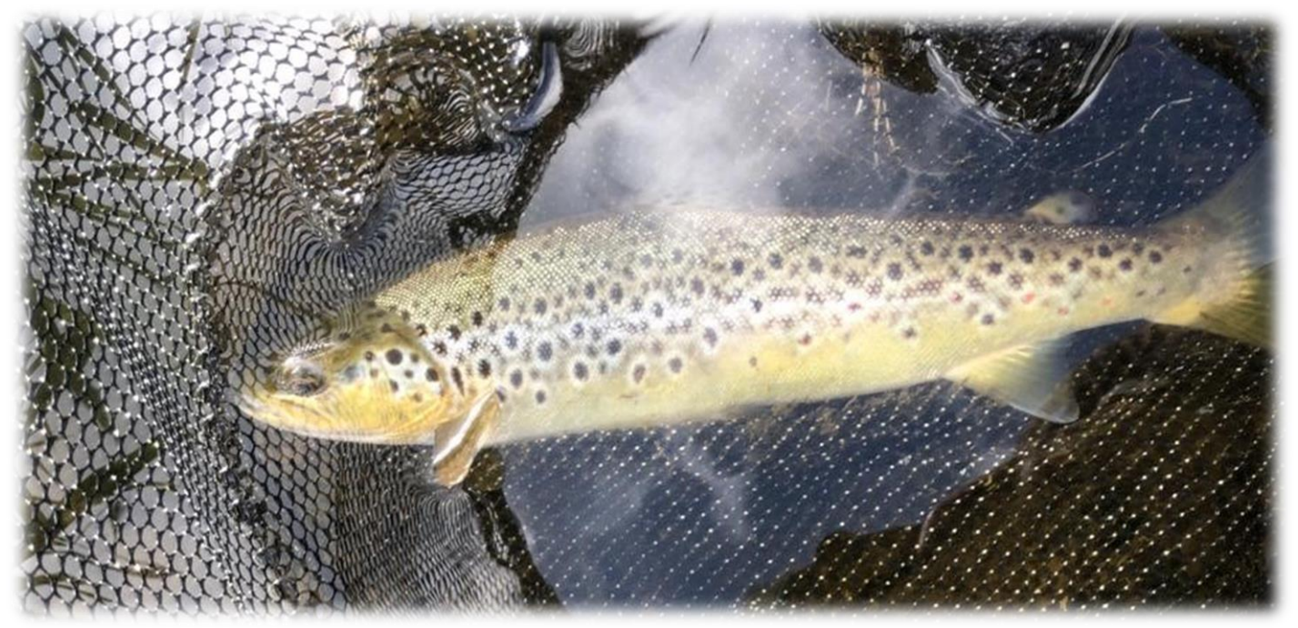
This Brown trout from the River Whiteadder, estimated at around 1lb in weight, was caught three times in three successive fishing trips in the same location by the same angler during the 2020 fishing season

During the last few seasons we have been asking anglers to take pictures of the left side of the Brown trout over 12" they catch. This allows us to identify and record individual trout from the spot pattern on their gill cover, and identify recaptures of fish that have previously been recorded.